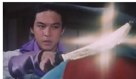
홍길동 Hong Kil-dong Hong Kil-dong Call No.: PN1997 H659 1986

Sometimes called the first North Korean film made purely for entertainment value, this film centres on the legendary Robin Hood-type character of Korean folk law, Hong Kil-dong.