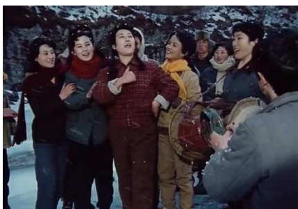
도라지꽃 A Broad Bellflower Toraji kkot Call No.: PN1997 T673 1987

A Broad Bellflower is one of the most cinematic films in North Korea. The film tells of a man's regret about his youthful decision to leave his lover and follow a wandering, indulgent life.