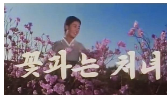
꽃파는 처녀 The Flower Girl Kkot p'anün ch'önyö Call No.: PN1997 K597 2010

Adapted in 1972 from a revolutionary opera of the same name, The Flower Girl is perhaps North Korea's most renowned film. Both the film and the opera toured across China and other Eastern Bloc countries.