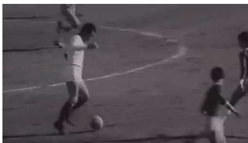
중앙공격수 Center Forward Chungang konggyöksu Call No.: PN1997 C4862 1978

In this North Korean football-themed movie, unique North Korean cultural aspects infuse relationships between players and management, family members, and senior and junior players.