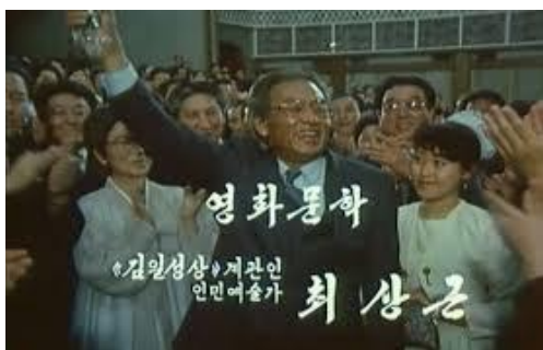
민족과 운명 The Nation and Destiny Minjok kwa unmyöng Call No.: PN1997 M5673 2011

The Nation and Destiny series was first shown in 1992. Regarded as one of the most noteworthy achievements in North Korean film history, it was a trigger of "the second literary revolution," the former North Korean leader King Jong Il initiated.