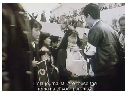
내가 본 나라 The Country I Saw Nae ka pon nara Call No.: PN1997 N3237 2010

This film series provides some insight into how North Koreans are supposed to perceive the outside world and what an outsider would think of North Korea.